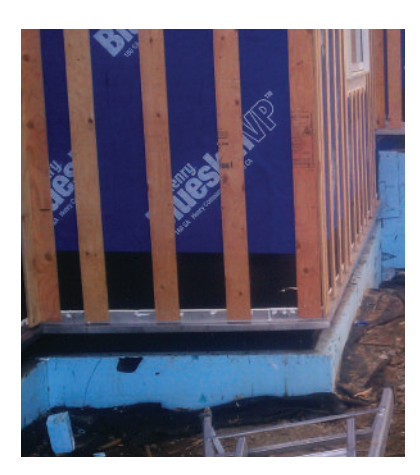
The exterior sheathing of the home was wrapped with a self-adhering vapor-permeable house wrap that serves as a weather-resistant air and water barrier. Furring strips were installed over this barrier allowing it to serve as a drainage plane for any bulk water that manages to get past the fiber cement siding.

"This will be our retirement house," said McKay. "Our goals were to have the tightest envelope and the most efficient systems we could, for the long run."