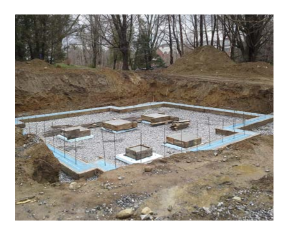
Four inches of rigid foam will wrap the slab perimeter while an additional 8 inches (R-35.6) of high-density EPS rigid foam will extend under the entire slab.

by the shortest routes possible. There is a central return and transfer ducts in the walls. "While we were working in the home last winter, we had record cold temperatures. We only had the first-floor air handler in and it kept the whole house comfortable," said Trolle.